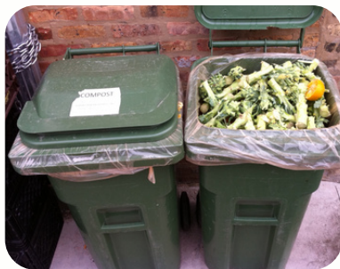
RESTAURANTS - Blind Faith Cafe

900,000+ residents have access to food scrap collection for composting