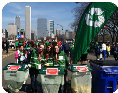
EVENTS - Chicago Marathon